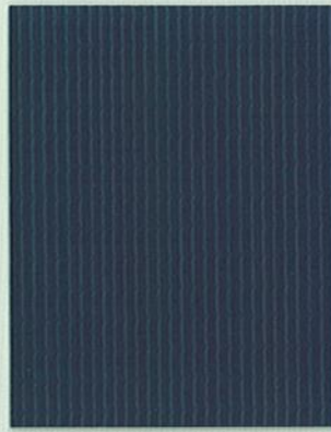
Navy XL 5047