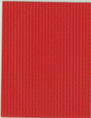
Red XL 5026