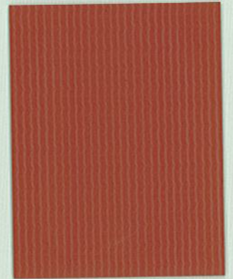
Rust XL 5009