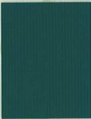
Glade Green XL 5011