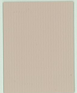
Tan XL 5038