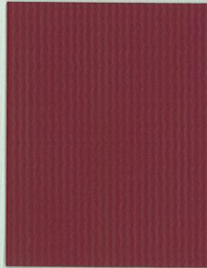
Burgundy XL 5015