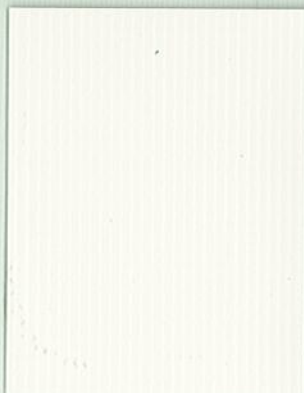
Ivory XL 5039