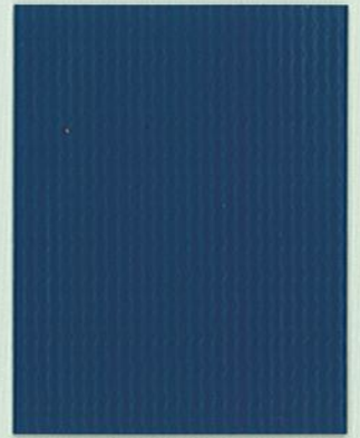
Dark Blue XL 5012