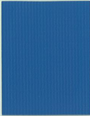
Medium Blue XL 5046