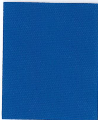
Coastal Blue NT7746