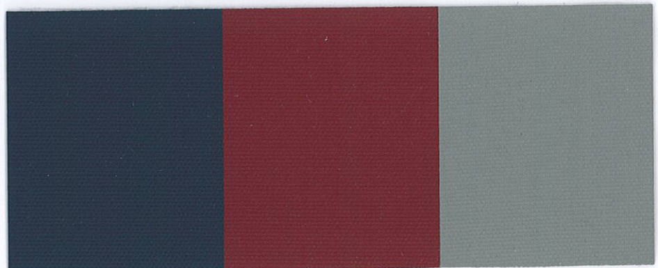
Navy Blue NT7747